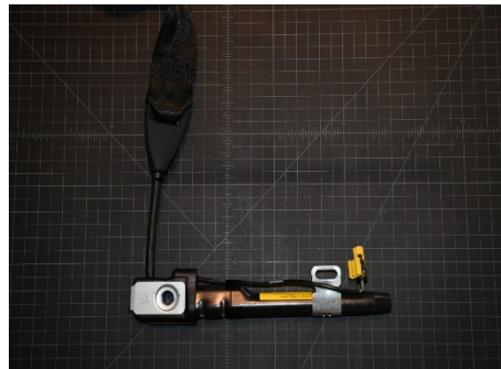
Figure 1 - The front outboard seat belt sill-end pretensioner of the 2018 Volkswagen Tiguan.