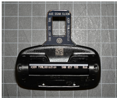
Figure 2 - The Crash Locking Tongue of the 2018 Volkswagen Tiguan.

On January 10, 2018, the National Highway Traffic Safety Administration's (NHTSA) Office of Defects Investigation (ODI) began investigating two incidents of seat belt separation. The separations occurred in two New Car Assessment Program (NCAP) tests conducted on the 2018 Volkswagen® (VW) Tiguan®, the first year of a new vehicle platform. The NCAP test is a 35mph, full frontal, rigid barrier crash with a belted 50 th percentile male Anthropomorphic Test Device (ATD) driver and a belted 5 th percentile female ATD front passenger. The tests were conducted on December 8, 2017, at MGA in Wisconsin, and December 13, 2017, at TRC of Ohio. The test reports are not currently available on NHTSA's website. During the crash tests, the driver seat belt webbing completely separated in tension at the latch plate, a device that VW calls a Crash Locking Tongue (CLT) (Figure 1). The CLT is a device that switches under load and the webbing is clamped, resulting in greater loads applied to the lap belt. Approximately 290,000 Tiguan® vehicles use the CLT device.