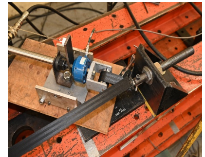
Figure 3 - Three-point anchoring held the webbing with an included angle of approximately 45 degrees.

On July 3, 2018, ODI upgraded their analysis to further examine the seat belt behavior to determine, in part, a root cause for the seat belt separation. Their research included a review of any vehicle and seat belt design changes for the 2018 Tiguan® platform and their effects on the performance of the seat belt system. Based on its analysis of the NCAP test results and numerous sled tests, VW asserted that the ATD umbilical cord exerted additional forces on the seat belt system, causing the separation. However, a micro analysis conducted by the National Transportation Safety Board (NTSB) verified the seat belts had failed in tension and not due to cuts or abrasion. To date, a safety recall campaign has not been opened to address this potential safety hazard.